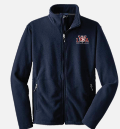
SCHOOL NAVY JACKET