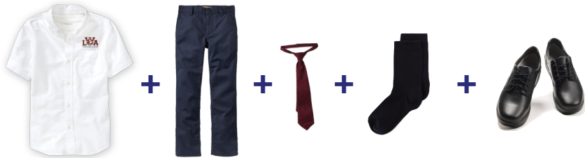
WHITE BUTTON DOWN SHIRT with School Logo