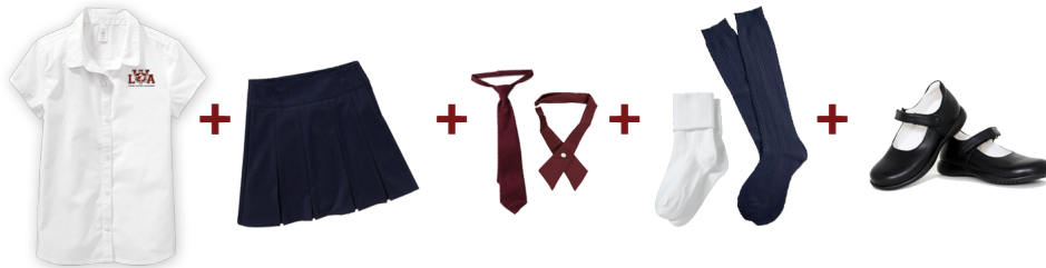
WHITE BUTTON DOWN BLOUSE with School Logo