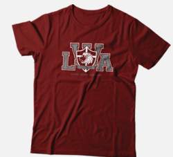
SPIRIT SHIRT For jean days, field trips, and special occasions.